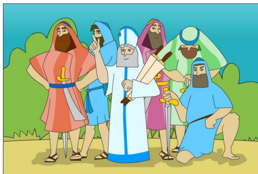
Mattathias and his five sons led a rebel Jewish army known as the Maccabees.

Over 2000 years ago, Jerusalem was in an area called Judea. Kings of surrounding countries were always trying to control Judea as they wanted to make their own kingdoms bigger and more powerful. One king from Syria, Antiochus IV, attacked Jerusalem. He tried to force people to practise a different religion and decided that their temple would now worship the god Zeus.