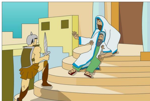
Antiochus's soldiers took over the Jewish Temple in Jerusalem.

One of the holiest places for Jewish people is Jerusalem. Hanukkah celebrates a miracle that happened in Jerusalem in ancient times.