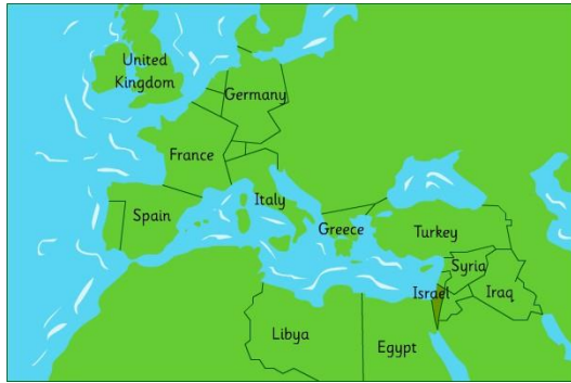
Israel is on the eastern shores of the Mediterranean Sea.

Hanukkah is a festival celebrated by Jewish people - followers of the religion of Judaism.