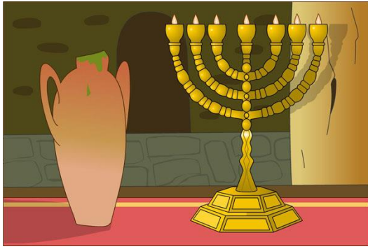
The temple menorah is a lamp with seven burners.

To make the temple in Jerusalem Jewish again, pure olive oil was needed to keep the menorah alight. The temple menorah is a holy lamp which has seven burners. It needed to stay lit all night, every night. But the oil containers had been spoilt. Only one remained. But, even though there was only enough oil left for one night, the lamps burned on... for eight nights! Hanukkah lasts eight days to remember this.