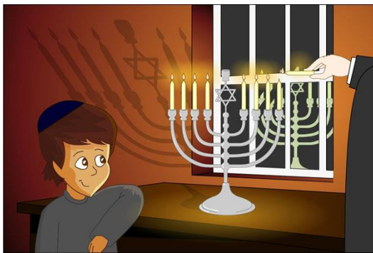
During Hanukkah, candles are lit each night.

To make the temple in Jerusalem Jewish again, pure olive oil was needed to keep the menorah alight. The temple menorah is a holy lamp which has seven burners. It needed to stay lit all night, every night. But the oil containers had been spoilt. Only one remained. But, even though there was only enough oil left for one night, the lamps burned on... for eight nights! Hanukkah lasts eight days to remember this.