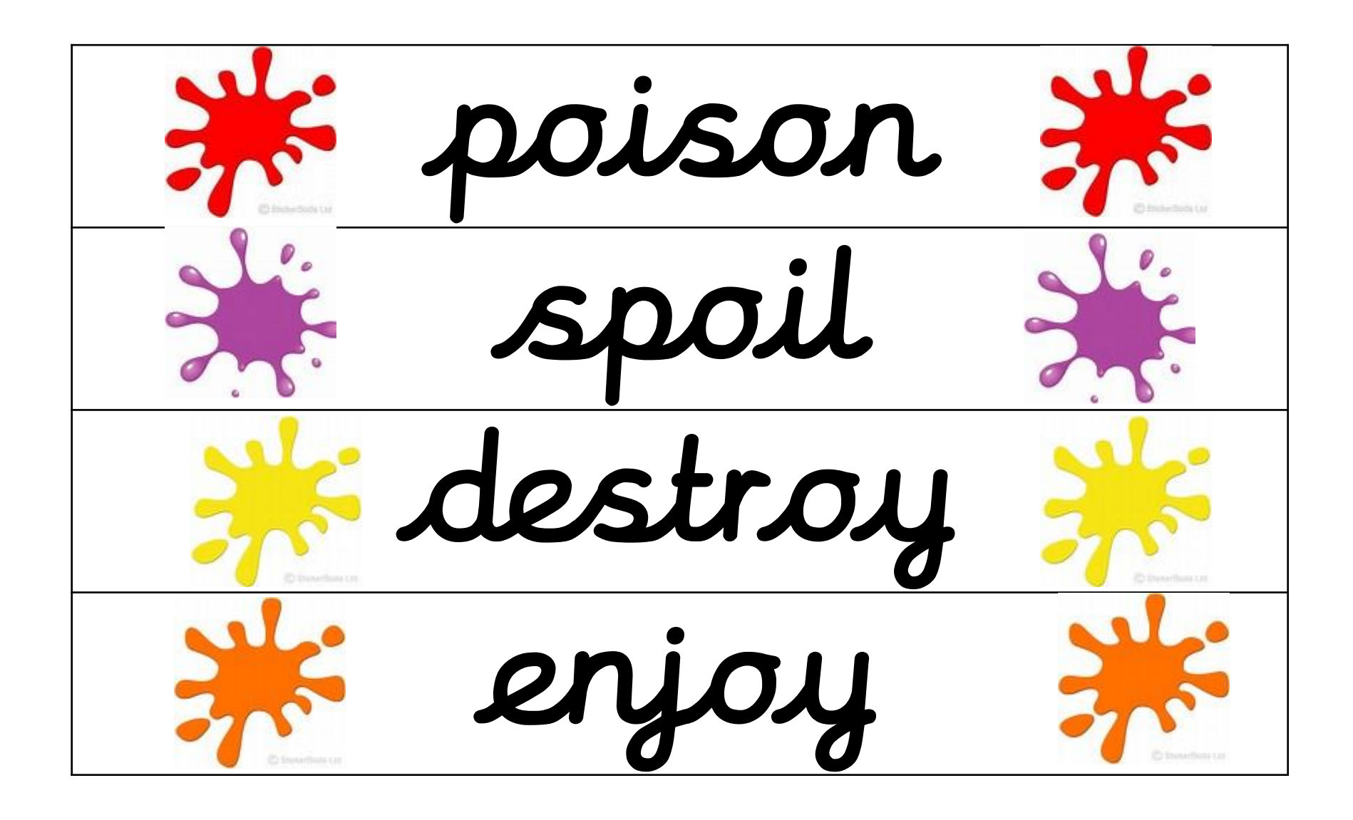
TBAT: read and spell words with oi and oy phonemes