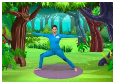
Try Cosmic Yoga