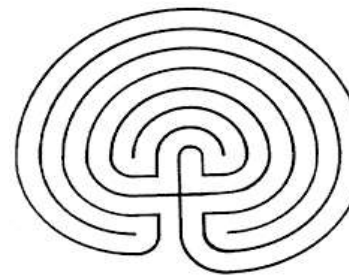
Use your finger to find the centre